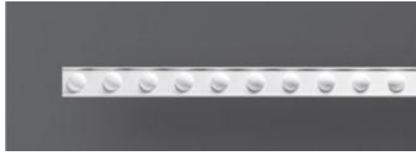
456 / FRISE